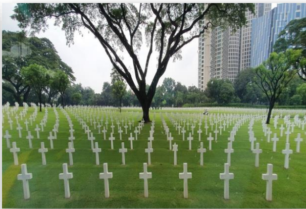
American War Memorial and Cemetery