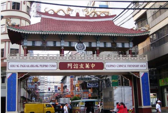
Filipino-Chinese Friendship Arch