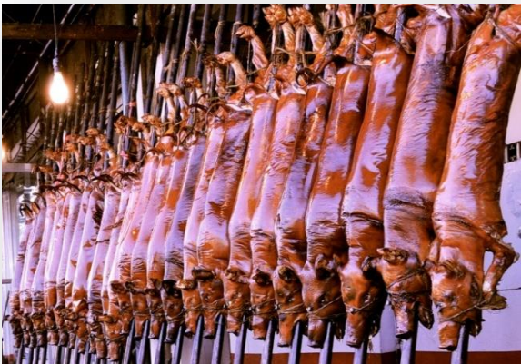
Rows of Lechon in La Loma