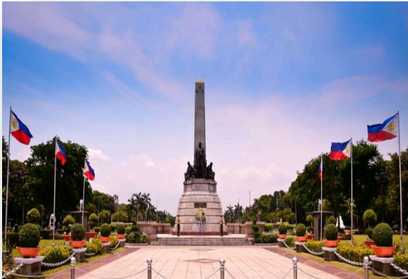
Rizal Park Monument