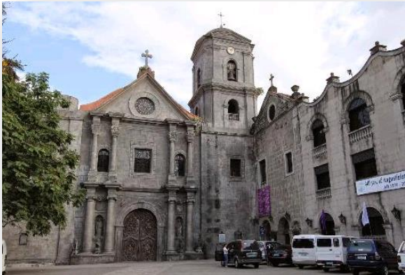
San Agustin Museum