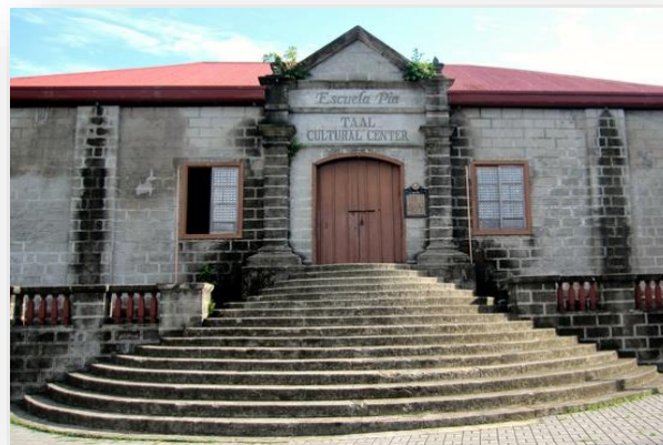
Taal Culutral Center