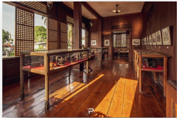
Galleria Taal (Camera Museum)