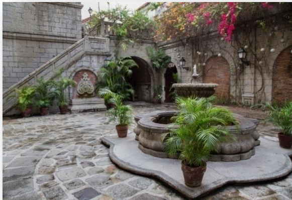
Plaza San Luis