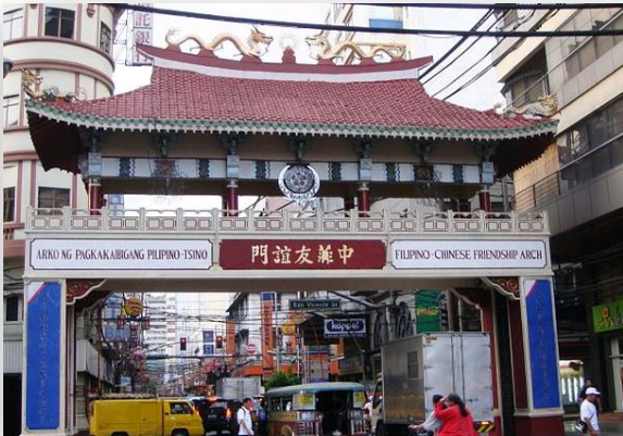
Filipino Chinese Friendship