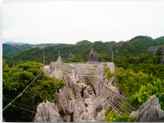
Sapot ni Ric