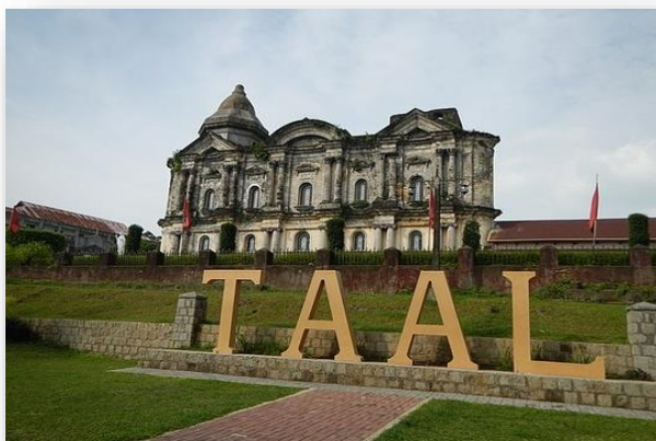
St. Martin de Tours Basilica